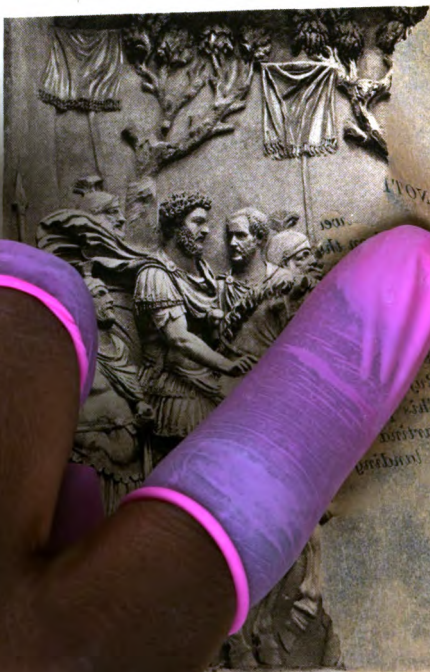
GERMAN PRISONERS IN THE FIGURE RELIEF FROM TRIUMPHAL ARCH.