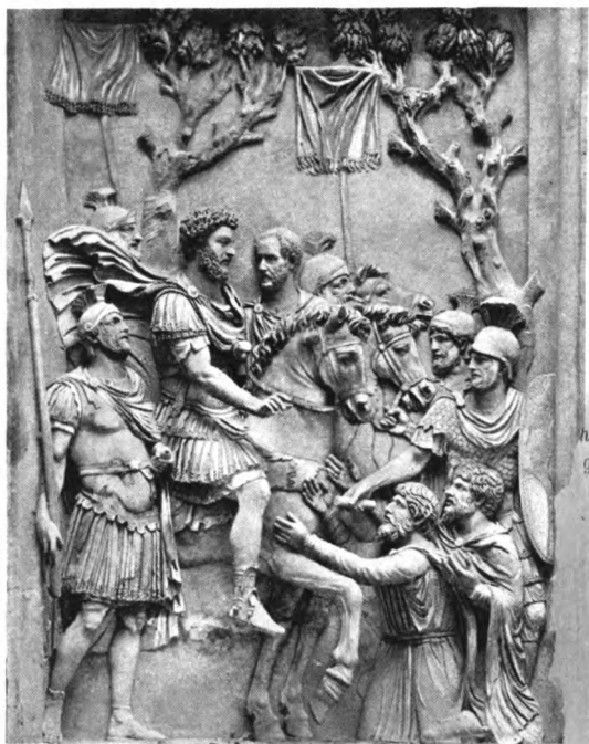
RECEIVING GERMAN PRISONERS IN THE FIELD. PANEL FROM TRIUMPHAL ARCH.