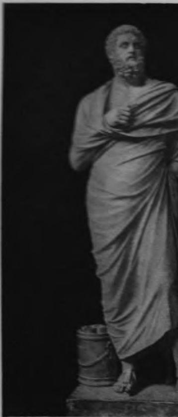
SOPHOCLES STATUE IN THE LATERAN MUSEUM