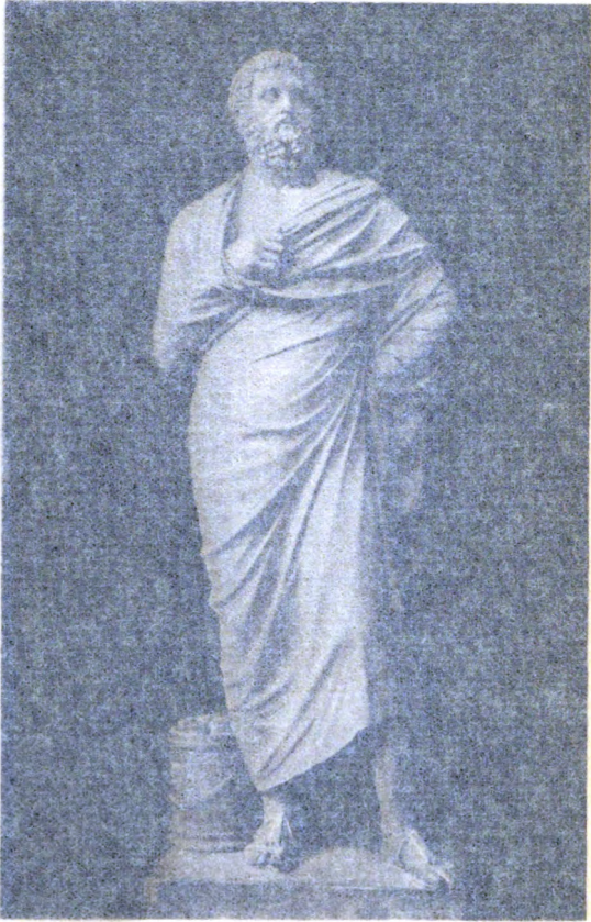
SOPHOCLES STATUE IN THE LATERAN MUSEUM, ROME.