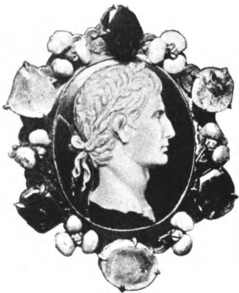
CAMEO PORTRAIT OF THE EMPEROR AUGUSTUS. FROM THE ABBEY OF ST DENIS